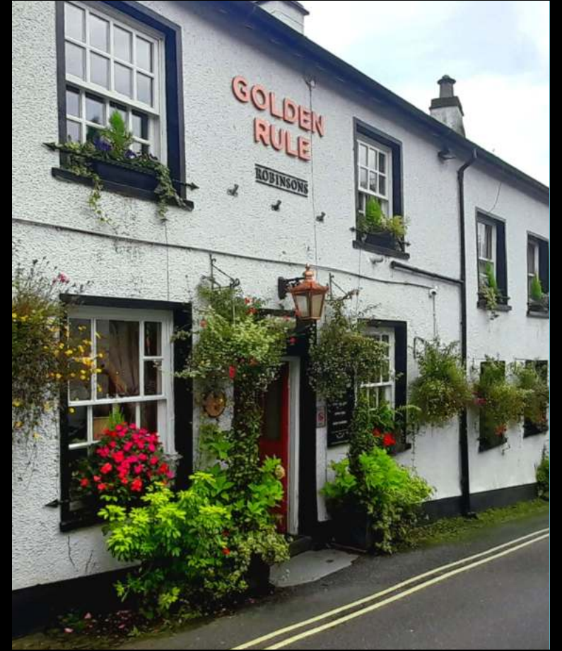
COSY RURAL RETREATS