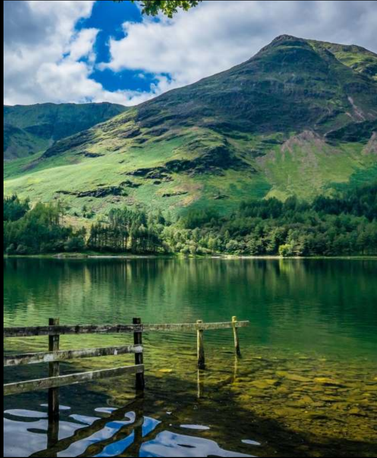
SERENE WATERS OF THE LAKES