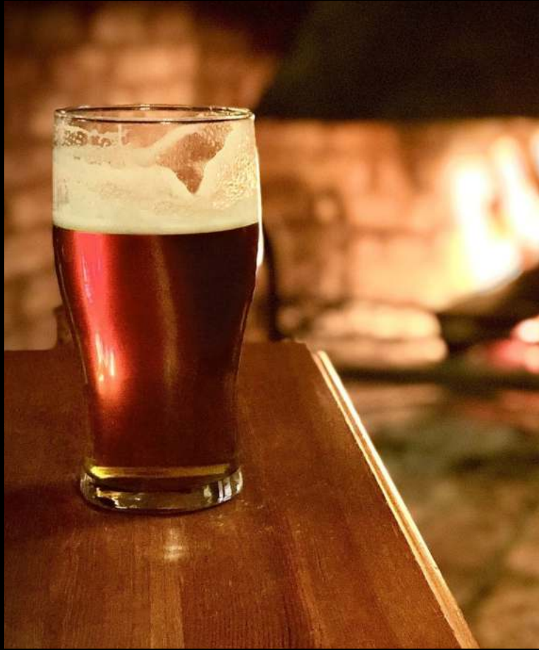
INDULGE IN A QUINTESSENTIAL BRITISH PINT